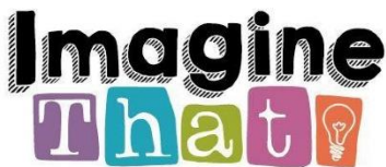
Image That! Our EYFS children had an amazing time at 'Imagine That' this week where they had a guided journey through all four zones of Imagine That! Click on the picture if you want to take a look and you can see pictures of their day on our Facebook page.

Easter Hampers: Thank you so much for your generosity with donations today, we are sure to have some amazing hampers for you to win for Easter. Raffle tickets are £1 per ticket and are on sale now on The Evolve hub https://www.myevolvehub.com/ you can get extra tickets when buying online, 6 tickets for £5 or 12 tickets for £10 so grab your winning ticket now!! You can also pop into school to get tickets at the office too but these are cash only or you can send some money in with your child. Tickets are available to wider family members also so please tell your friends and family who are welcome to buy some and have a chance at winning. Tickets bought online will be sent home with your child.